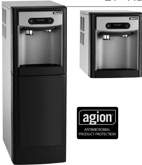
Shown with optional base stand #00956292