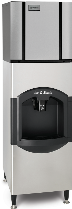
CD40522 WITH CIM0325