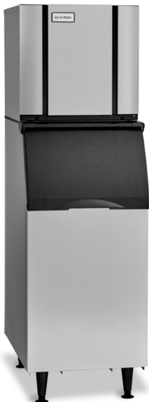
CIMO325 ON B42