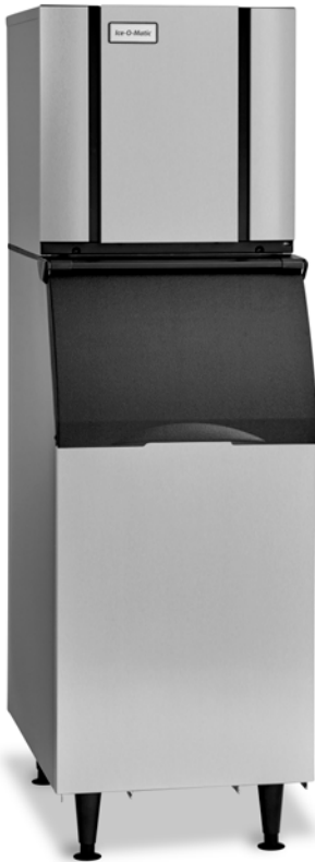
CIMO525 ON B42