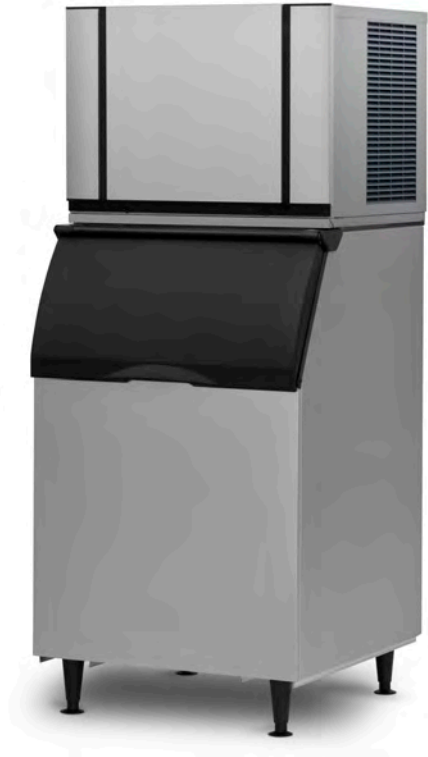
CIMO635 ON ICB230SC