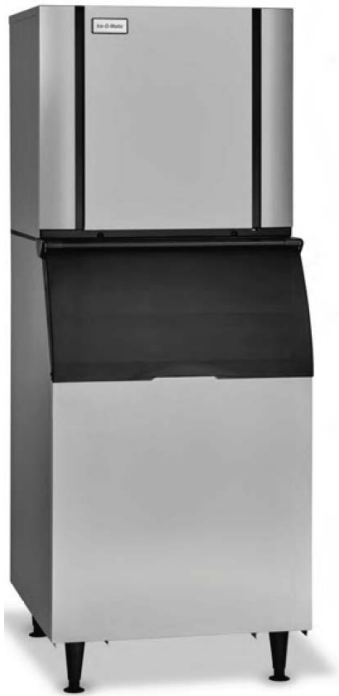
CIMO835GA ON CIB230