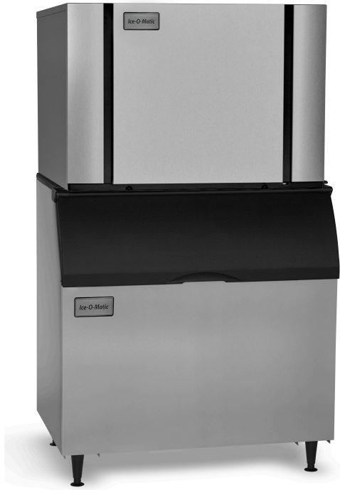
CIM1845 ON B110