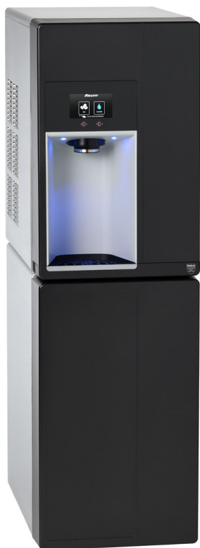
4.3" touch display with touch free dispensing