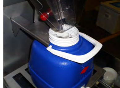
Jug Filler Dispenser Attachment

The perfect solution for employees working in mines, on construction sites, LNG industries or tough working conditions that require ice for hydration.