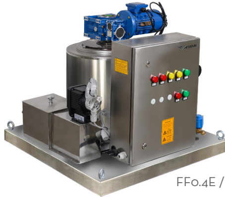
FFo.4E / FFo.6E