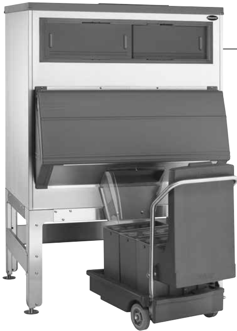
Shown with SmartCART™ 75, other configurations available