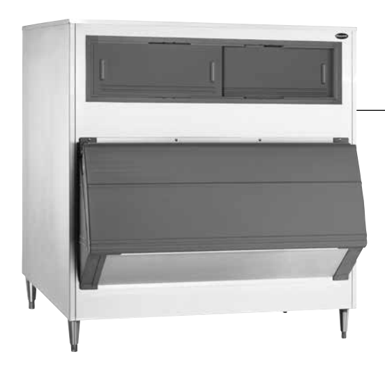
Model SG1010S-48 shown, other models will vary.