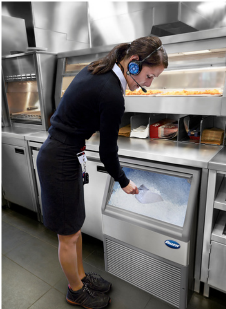
Ice machine bin for foodservice

1 Model ships EXW Incoterms 2010 – Wislina, Poland. Models not for use in the United States.